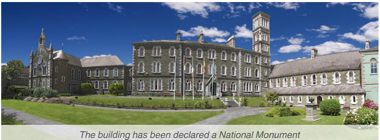
The building has been declared a National Monument

We are the only boarding school for Summer Camps in Youghal