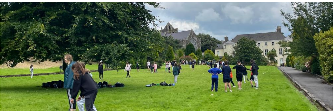
Hurling and rugby fields