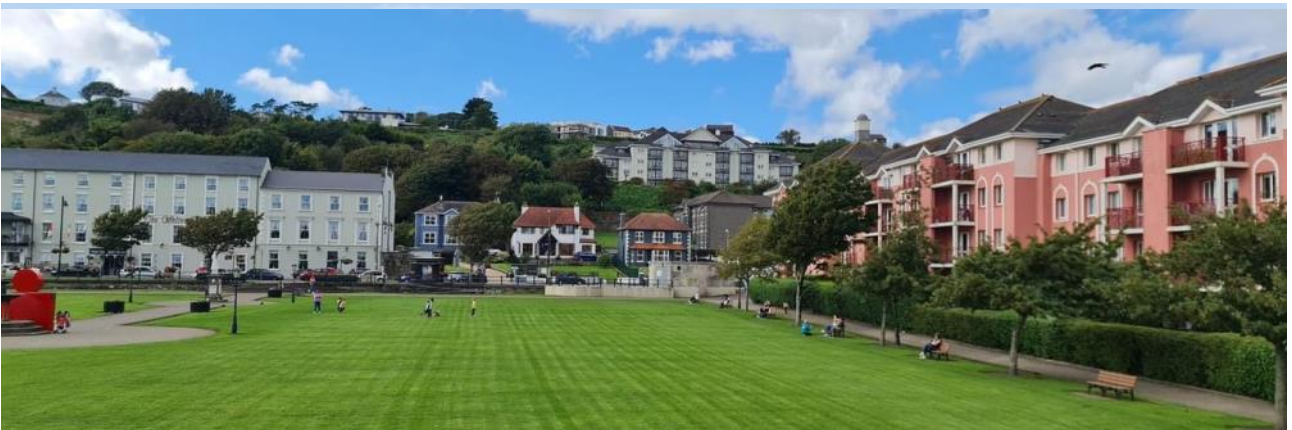
Gardens and parks